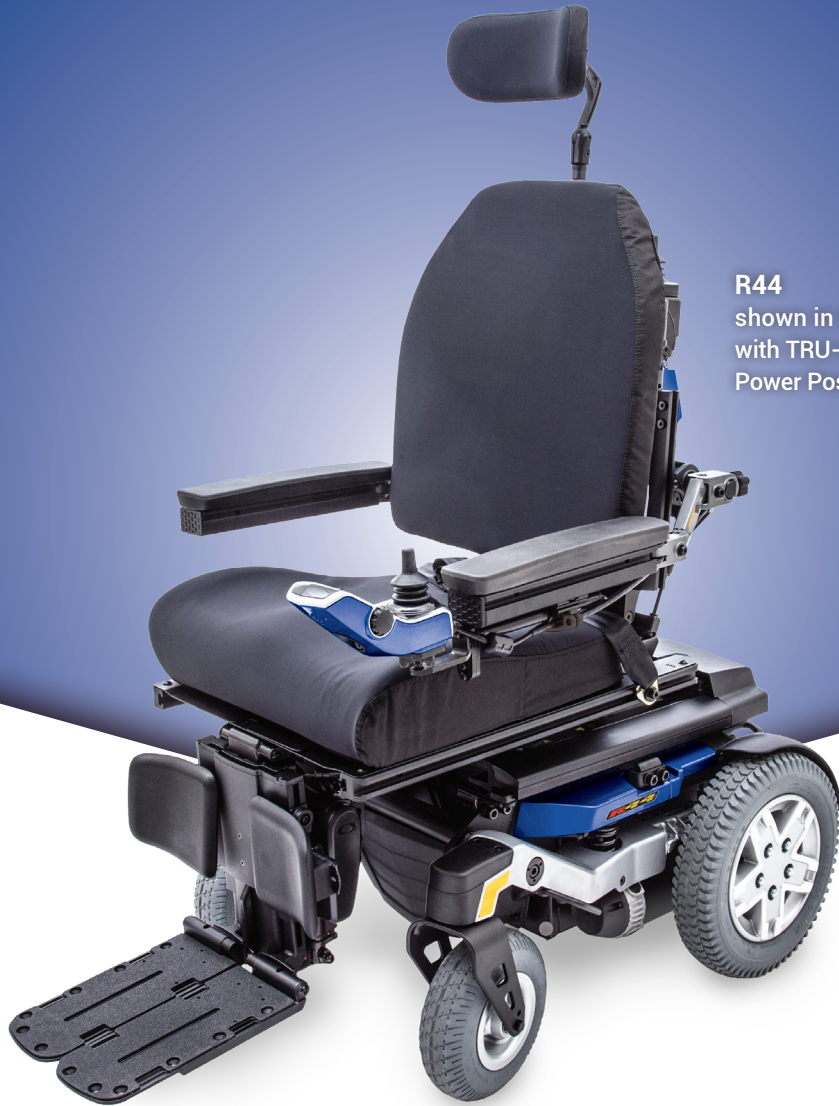
R44 shown in Viper Blue with TRU-Balance® 3 Power Positioning